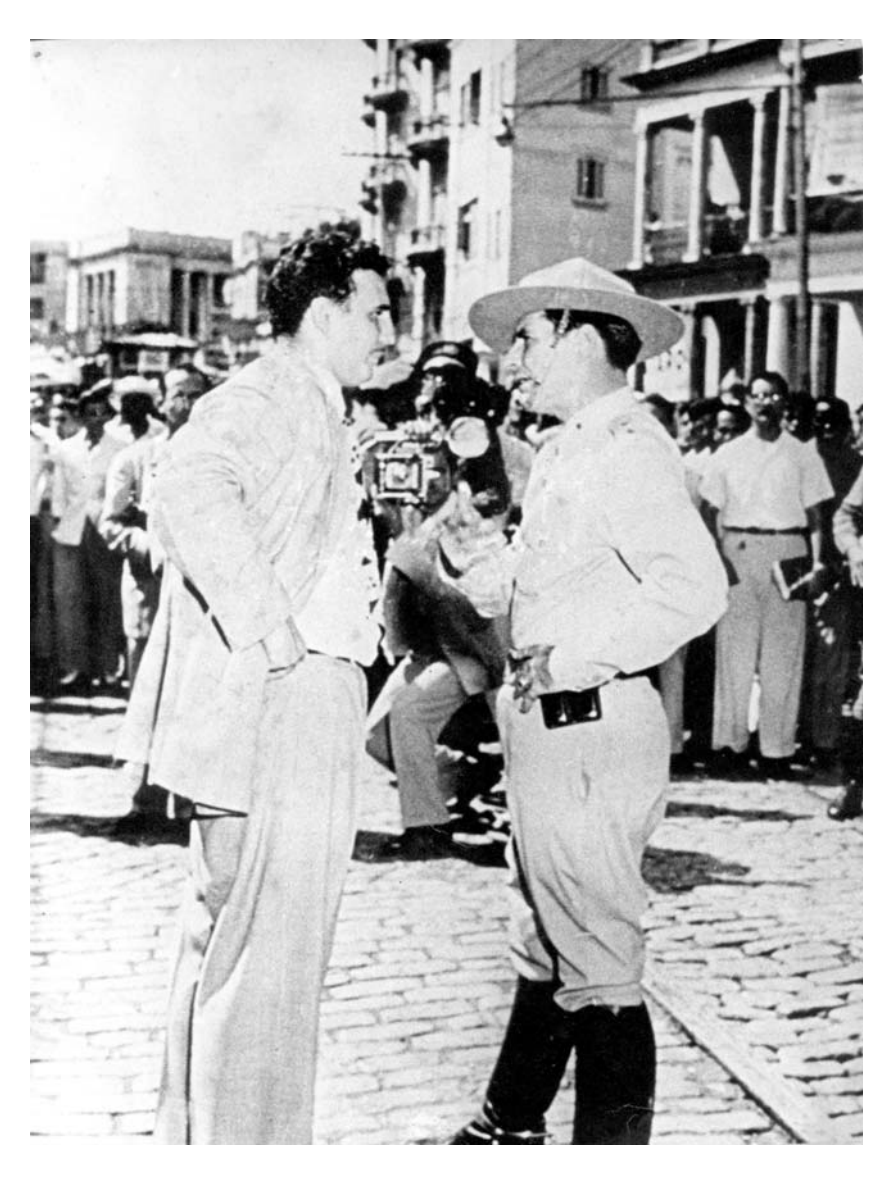
Fidel Castro argues with an army officer who is trying to stop a demonstration.