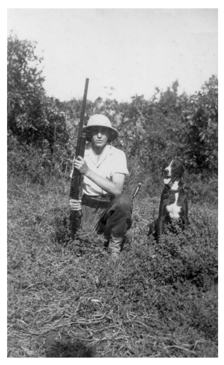
Fidel liked to explore and hunt while on vacation in Birán.