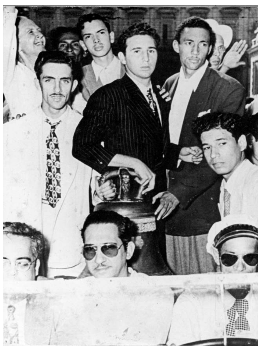
With a group of university students, Fidel guards the Demajagua bell, symbol of the beginning of the Cuban independence wars.