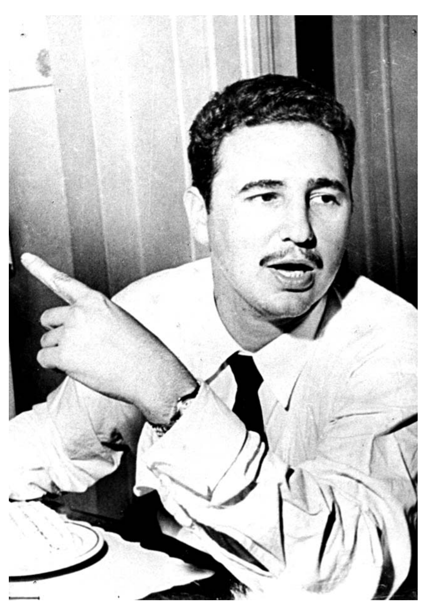
Fidel fought actively against the coup d'état.